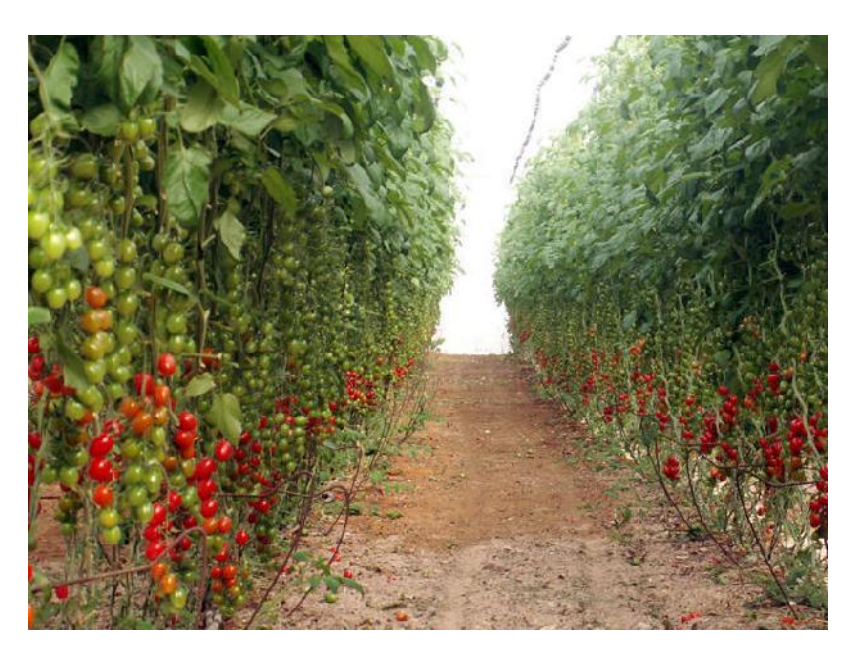
Fig 3: Show Tomates in green house

protecting against some of the major pests such as white fly. There is definitely a worldwide trend to covered cropping especially in tomatoes. When consumers demand better quality they are really saying that they want indeterminate type tomatoes. When a farmer starts to build net-houses and greenhouses his investments and growing costs increase dramatically. He must learn how to optimize revenues and minimize expenses so as to attain the maximum profits.