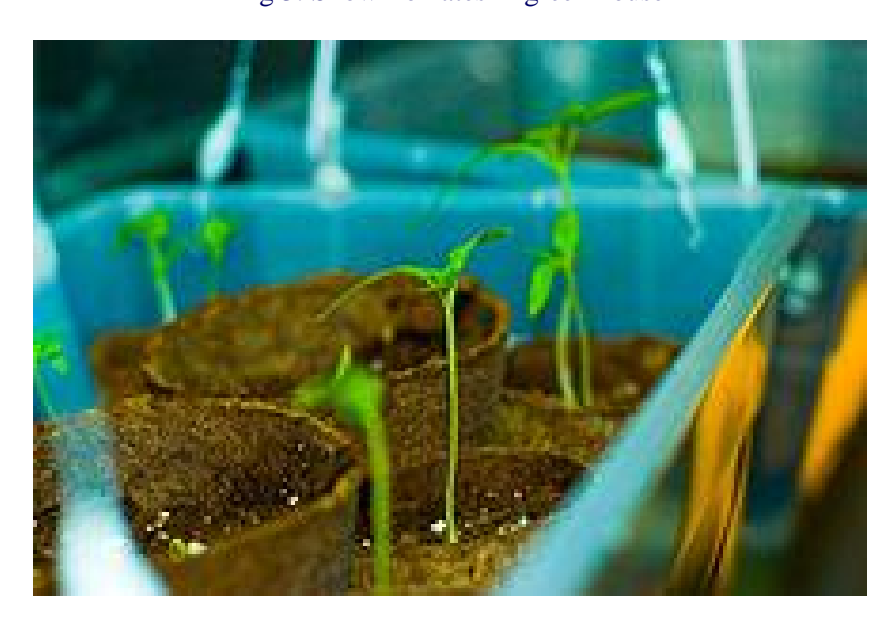
Fig4: Tomates seedling