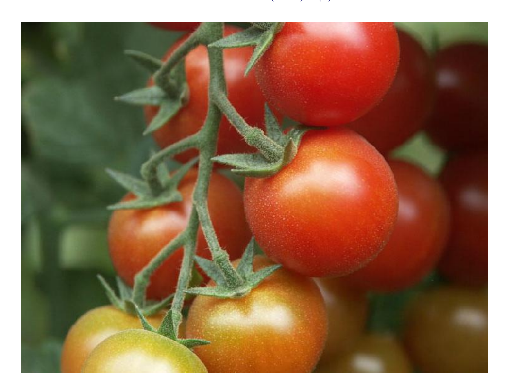
Fig 1: show tomates in the plant

Tomatoes are members of the nightshade family and, because of this, were considered for many years to be poisonous. Indeed, many crops in this family contain highly toxic alkaloids. Tomatine occurs in toxic quantities in the tomato foliage but is converted enzymatically to a non-toxic form in the fruit. Because of these beliefs, the crop was not used for food until the 18<sup>th</sup> century in England and France. Tomatoes were introduced to the United States in 1710, but only became popular as a food item later in that century. Even as late as 1900, many people held the belief that tomatoes were unsafe to eat. Use of the crop has expanded rapidly over the past 100 years. Today more than 400,000 acres of tomatoes are produced in the United States. The yearly production exceeds 14 million tons (12.7 million metric tons), of which more than 12 million tons are processed into various products such as soup, catsup, sauce, salsa and prepared foods. Another 1.8 million tons are produced for the fresh market. Global production exceeds 70 million metric tons. Tomatoes are the leading processing vegetable crop in the United States.