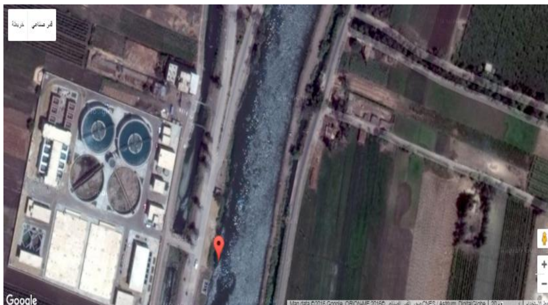
Fig (1): Aga surface water plant.

For THMs detection, GC Varian Cp- 3800 with ECD and column Cp- sil 19 were used to determine the concentrations of THMs groups comprised \text{CHCl}_3 , \text{CHCl}_2\text{Br} , \text{CHClBr}_2 and \text{CHBr}_3 according to USEPA (1998) . Other parameters as temperature and residual chlorine were measured in the field by using a mercury thermometer of the range (0 – 100 °C) and DPD Lovibond MD-100, respectively (APHA, 2012)