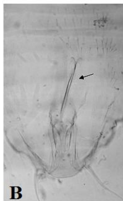
Plate: A: M. longiscleritus male; B: Male genitalia, arrow shows long genital sclerite.