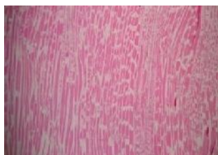
2.a. Section of probiotic fed fish muscle after 15 days

Plate 2.a. and 2.b shows histological changes in the skeletal muscle of probiotic fed fish Puntius conchonius after 15 days and 30 days of an experimental period.