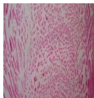
1.b. Section of control fish muscle after 30 days

Plate 2.a. and 2.b shows histological changes in the skeletal muscle of probiotic fed fish Puntius conchonius after 15 days and 30 days of an experimental period.