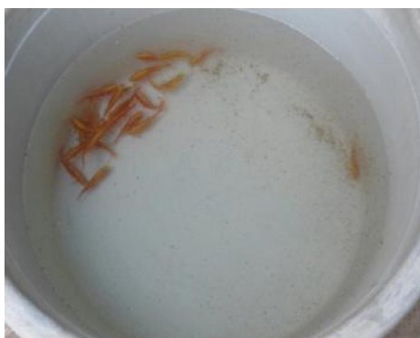
Plate No.1. Experimental fish Puntius conchoni us

and 5.4 cm length) were purchased from Sirago fish farm, Nerinjipet, Erode District, Tamil Nadu and acclimatized in laboratory conditions (23 0 C/74 0 F, pH 7.0) with continuous aeration for two weeks prior to the commencement of an experiment. Stocked fish were fed with supplementary diet ad libitum .