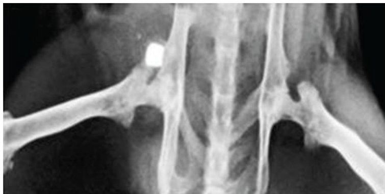
D. Implanted with zinc disc and treated with SKP 200 mg/kg