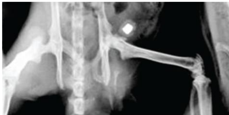
B. Disease control group surgically implanted with zinc disc