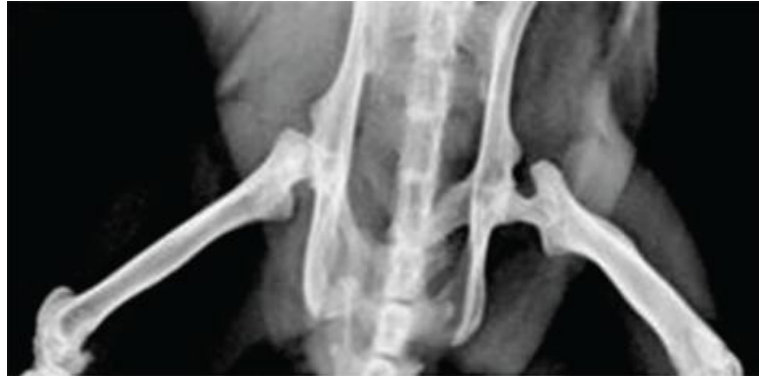
A. Sham operated group without implantation

Figure 1 shows the results of effects of Seenakara Parpam on zinc disc implantation model of urolithiasis.