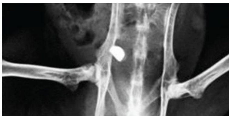
E. Implanted with zinc disc and treated with SKP 400 mg/kg