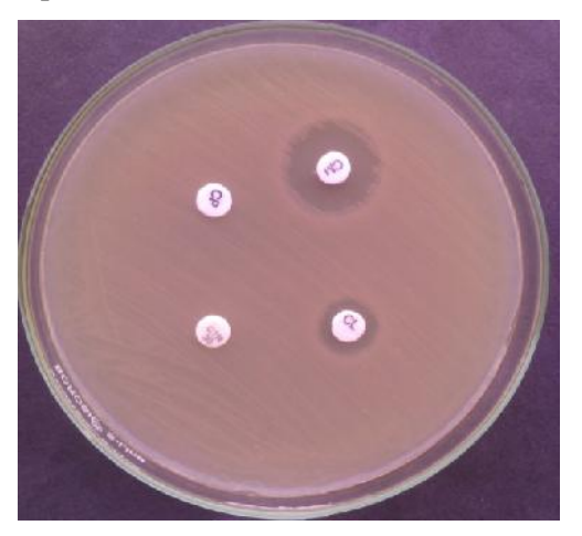
Fig 3.2 Phenotypic confirmatory test, Double disc diffusion test (DDDT) of an ESBL producing isolate showing zone size of more than 5mm in the disc with ceftriaxone/sulbactam (CL) and cefoperazon /sulbactam (CM) (i.e. antibiotics with inhibitor) as compare to ceftriaxone (CTR) and cefoperazone (CP) alone (i.e. antibiotics without inhibitor).

showing zone size of more than 5mm in the disc containing antibiotic and inhibitor as compared to the disc which contain only antibiotic (without any inhibitor). Clavulanic acid was the good inhibitor for ESBL producing isolates (Fig 3.2).