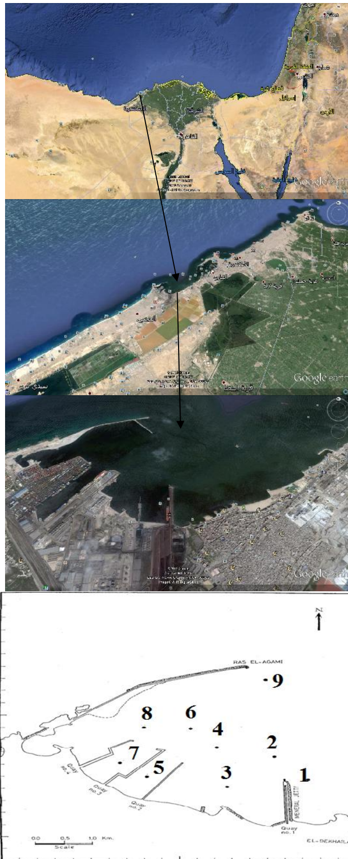
Figure 1. El-Dekhaila Harbour occupies the western side of El-Mex Bay