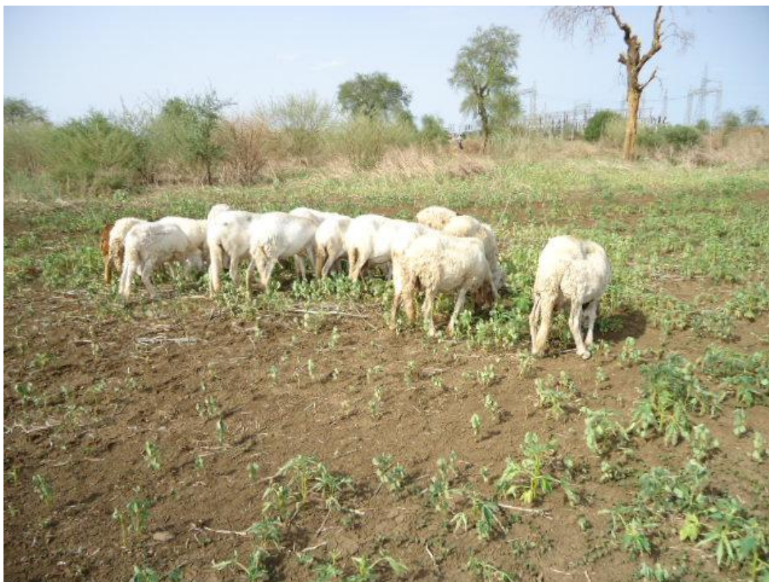
Figure 2. Begait sheep grazing in fallow land

relatively secure stock against theft and protect from predation or extreme weather condition. Even though in a diminutive way tethering was practiced in the study districts to protect sheep theft, to avoid crop damage and to use the limited grazing properly. Similar management practices were identified in south western Ethiopia by Berhanu (1995) and Workneh (1992) in densely populated parts of southern Ethiopia.