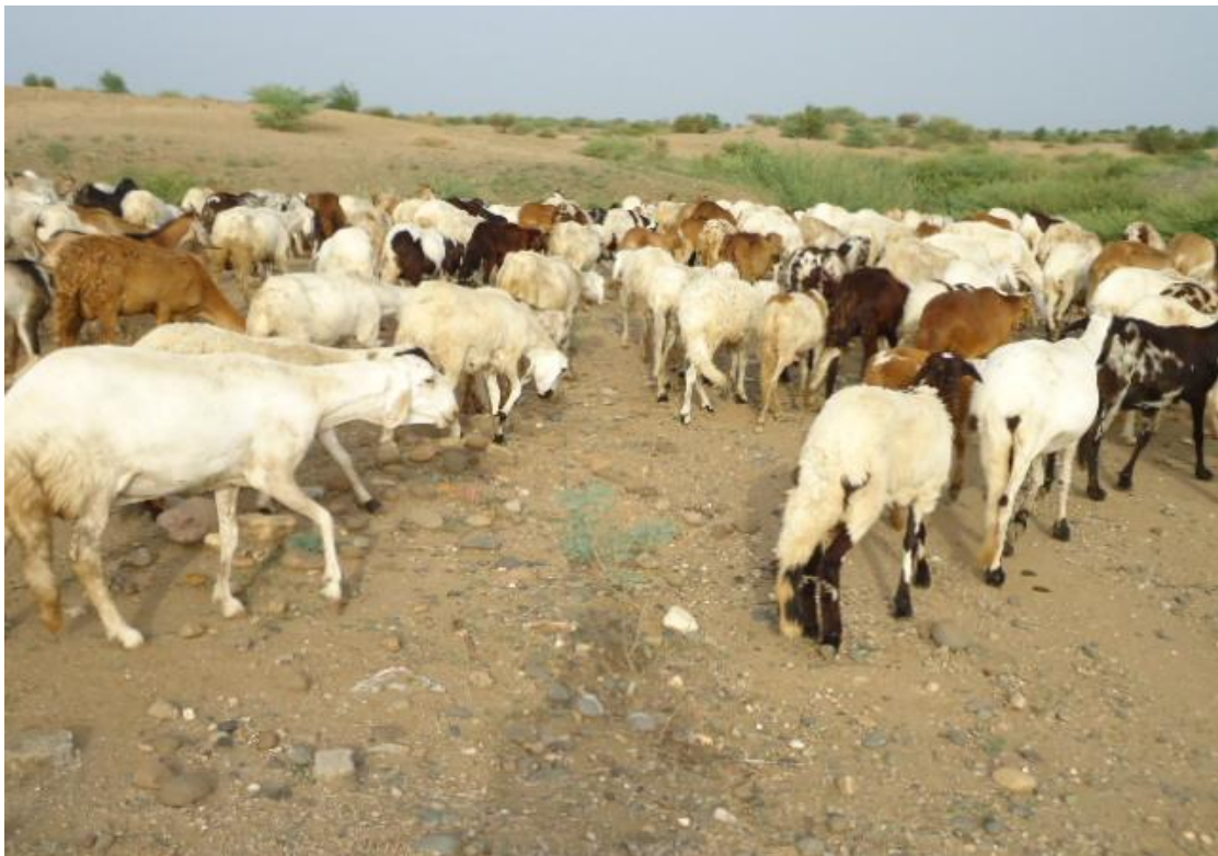
Figure 4. Begait sheep in their communal grazing land