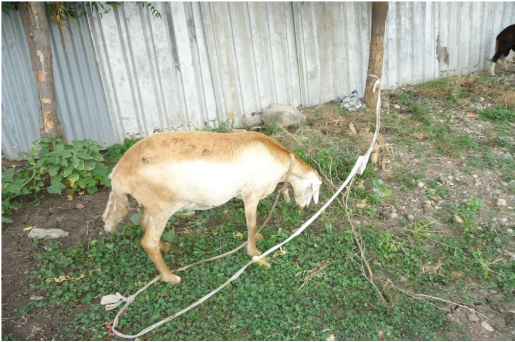
Figure 3. Begait sheep tethered in their back yard