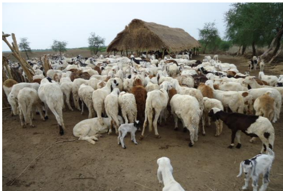
Figure 5. Sheep house wet season