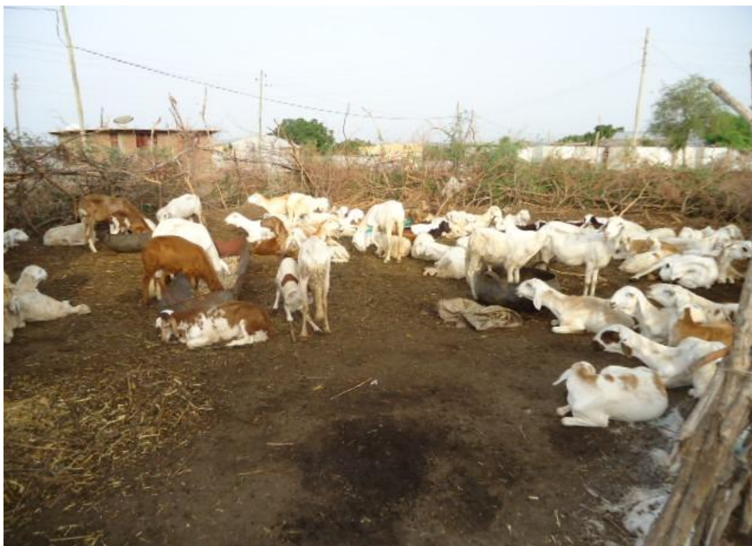
Figure 6. Sheep Housing (dry season)