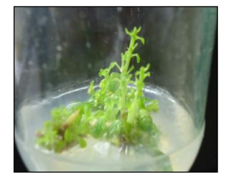
Fig.1a Induction of callus with Multiple shoot