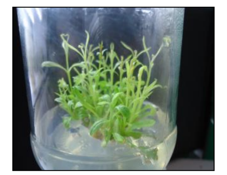
Fig.1b High frequency regeneration on MS