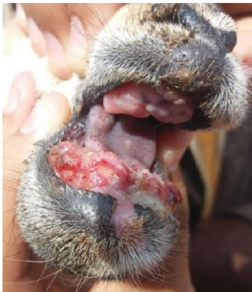
Fig. 2 Photograph of a sheep showing severe proliferative orf lesions and fissure formation on lower lip.