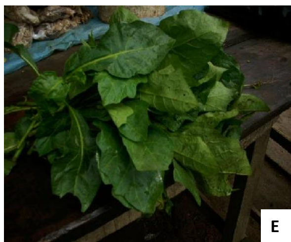
Figure 1: Pictures showing the leaves of [A] Vernonia amygdalina [B] Ocimum gratissimum [C] Talinum triangulare [D] Telfairia occidentalis [E] Solanum macrocarpon