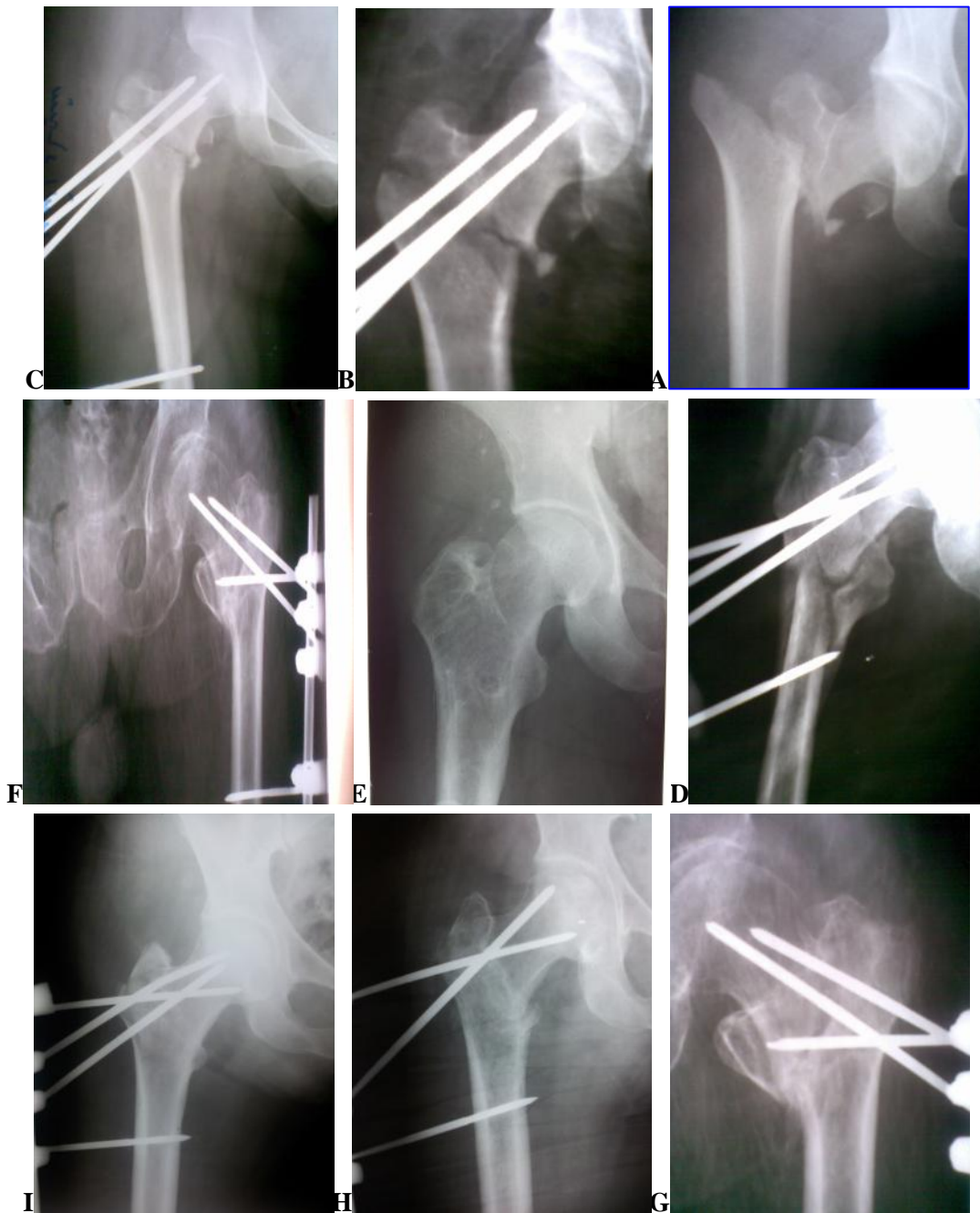
Figure 2 a. Preoperative high velocity fracture with contra lateral distal femur fracture b. immediate postoperative x-ray , unstable intertrochanteric fracture fixed with external fixation.c.4 weeks later, the fracture in stage of union. d. unstable intertrochanteric fracture in 35 years patient ,with high energy trauma, this x-ray show anatomical reduction & fixation e. this x-ray for fracture (d), taken 12 months after removal of external fixator showing excellent healing (F,G,H and I ), geriatric fractures fixed with external fixation taken 8 & 10 weeks shows bone healing in progress.