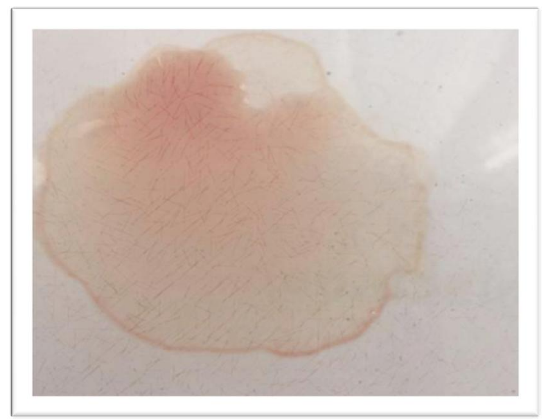
Fig .1 After add drop from mercaptoeathanol, agglutation still antibody is IgG).