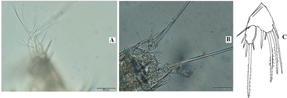
Fig.4) Canthocamptus staphylinus

A. Pleopod B. Caudal ramus C. Fifth Leg of Female