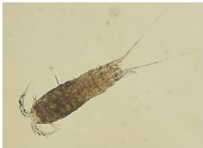
Fig.3) Harpacticoida, Females in the genus Canthocamptus

Females in the genus Canthocamptus are characterized by a greatly reduced second seta on the leg 5 basal expansion, while males have the outer corner of the leg 4 endopod segment 2 produced into a spinous process (Fig. 3).